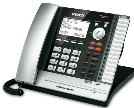
UP406 Extension Deskset