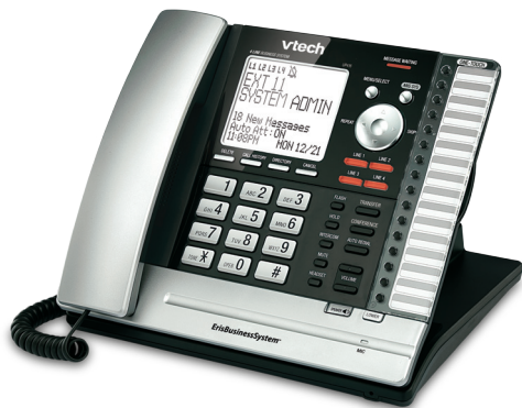
UP416 Main Console

This 4-line, expandable system keeps up with your growing needs but also keeps it simple—no need for complicated wiring or expensive installation technicians. It's a low-maintenance way to manage your calls and keep your business thriving.