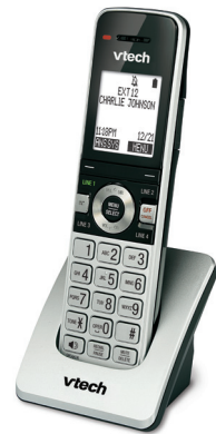
UP407 Accessory Cordless Handset